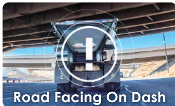
Road Facing On Dash